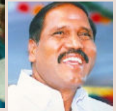
N. Rangasamy Chief Minister