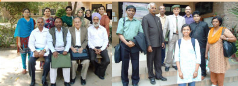
InSPA delegates at the conference venue