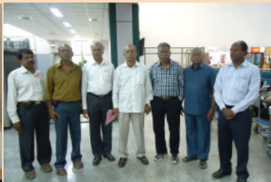
InSPA delegates at Ahmedabad Airport