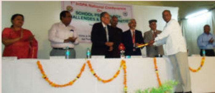
Inaugural session of the First InSPA National Conference