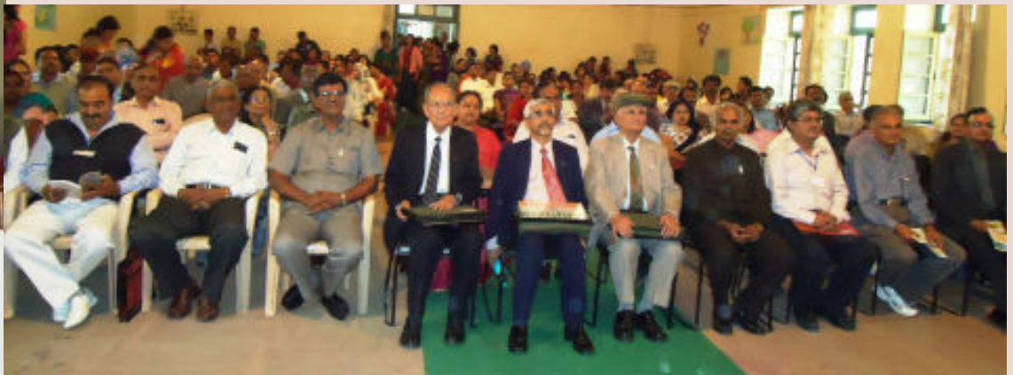
Delegates of the First InSPA National Conference held at JNV University, Jodhpur on 26-28 November, 2011