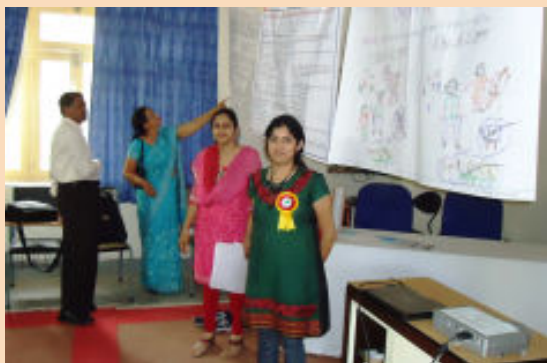
Poster presentation during the first conference of InSPA