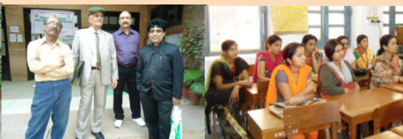
InSPA delegates at the conference venue