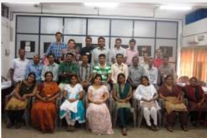
Participants of the school psychology training programme held in Calicut 2012